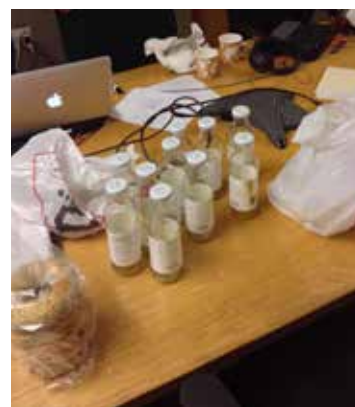
Bagels and lots of iced tea kept the team fueled up.